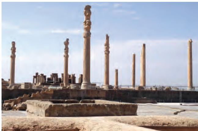
Columns at Persepolis

Susa and Persepolis. For that purpose, emperor Cyrus got Greek architects and sculptors from the Greek settlements in Asia minor under his rule.